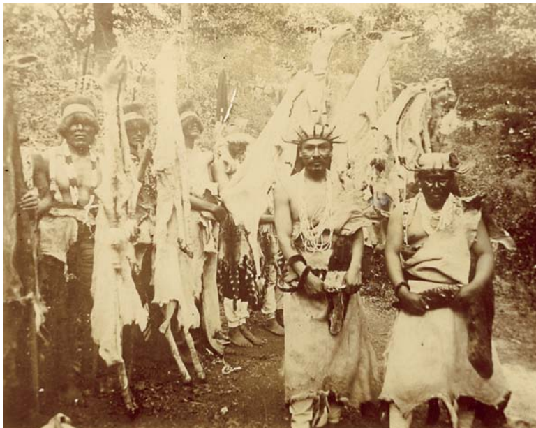
Hupa White Deer Dancers, ca. 1895.

Ultimately, American Indian peoples' connection to place is about more than simply caring for the environment. That connection has been maintained through generations of observation, in which people developed environmental knowledge and philosophies. People took actions to ensure the long-term sustainability