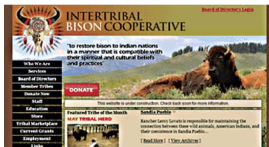
Home page of the InterTribal Bison Cooperative's website. Bison is tasty and healthy meat.

promoting better health, perpetuating cultural traditions, and creating economic opportunity through two farms that sell traditional O'odham foods. Returning to these traditional food practices supports the O'odham community and enables them to use their environment as their ancestors did. As diabetes and other health problems affect more and more people worldwide, many could benefit from traditional O'odham and other American Indian foods and diets.