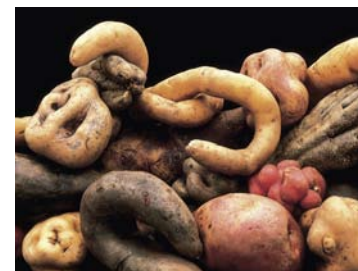
By the 1500s, indigenous Andean farmers had developed more than three thousand varieties of potatoes.

Sharing agricultural knowledge was one aspect of early American Indian efforts to live side by side with Europeans. As relationships with the newcomers grew into competitions for land and resources, the groups were not always successful in their efforts to coexist. So, the first Thanksgiving was just the beginning of a long history of interactions between American Indians and immigrants. It was not a single event that can easily be re-created. The meal that is ingrained in the American consciousness represents much more than a simple harvest celebration. It was a turning point in history.