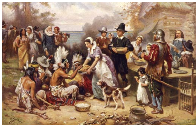
The First Thanksgiving 1621 J. L. G. Ferris.

In this poster, we take a look at just a few Native communities through the prism of three main themes that are central to understanding both American Indians and the deeper meaning of the Thanksgiving holiday. The themes are: