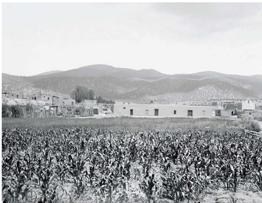
Picuris Pueblo, New Mexico, where the average annual rainfall is about 14 inches. Photo by Adam Clark Vroman, 1899. Courtesy of the National Anthropological Archives, Smithsonian Institution

Traditionally, being a responsible caretaker in this type of mutual relationship has meant respecting nature’s gifts by taking only what is necessary and making good use of everything that is harvested. This helps ensure that natural resources, including foods, will be sustainable for the future. In this way of thinking, the Diné, or Navajo, believe that people should live in a state of balance or beauty within the universe. This state of balance is called hozho in the Diné language.