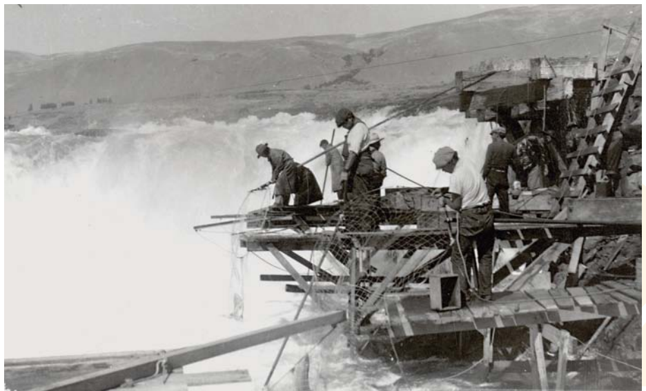
Salmon were once plentiful at Celilo Falls on the Columbia River, but the falls were flooded by the construction of The Dalles Dam in 1957. Today, Yakama fishermen cannot harvest salmon from this traditional fishing location.

Today, because of overharvesting and the effects of the Columbia River’s many hydroelectric dams, fewer and fewer salmon complete their upstream journeys, and salmon populations have dramatically declined. The people are involved in efforts to restore the salmon and, with them, the Yakama community and culture.