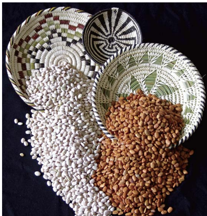
White and brown tepary beans with traditional Tohono O'odham baskets.

For the Tohono O'odham of southern Arizona and northern Mexico, early encounters with Spanish colonizers affected their way of life, but the U.S. government has had a much greater impact. Farming was always tied to the ceremonies, songs, dances, and traditional ways of the Tohono O'odham, or "People of the Desert." In the O'odham language, this integrated way of life is known as the Himdag. During summer monsoons, O'odham farmers used flood waters to irrigate thousands of acres of tepary beans, corn, squash, melons, chiles, and other nutritious foods that are well adapted to the region's short, hot growing season. Until the 1920s, they farmed more than 20,000 acres.