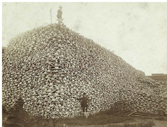
A mountain of bison skulls, ca. 1870. By 1893 only a few hundred bison remained in North America. Today there are hundreds of thousands.