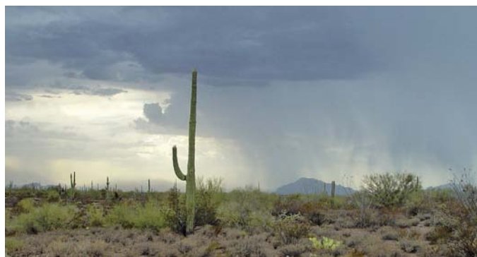
Summer in southern Arizona and northern Mexico brings extreme heat and life-sustaining rains.

Even so, Native American contributions continued to be essential to the survival of Europeans. If not for the generosity and knowledge of the Native peoples who met the explorers Lewis and Clark during their travels in the Northwest from 1804 to 1806, their expedition probably would have ended in disaster. Ultimately, Native encounters with Europeans resulted in the loss of entire Native communities, traditional ways of life, indigenous knowledge, and access to foods that had sustained Native people for thousands of years. War, genocide, disease, dispossession of lands, and ill-conceived federal policies profoundly affected American Indian communities and their environments. The consequences are still felt today. Overharvesting, pollution, and reduction of wilderness habitats have also had an effect on the ability of Native people to grow, gather, or hunt their traditional foods. As they look for ways to keep their cultures alive and to address modern economic and health issues, many Native communities are taking steps to revive their traditional food practices.