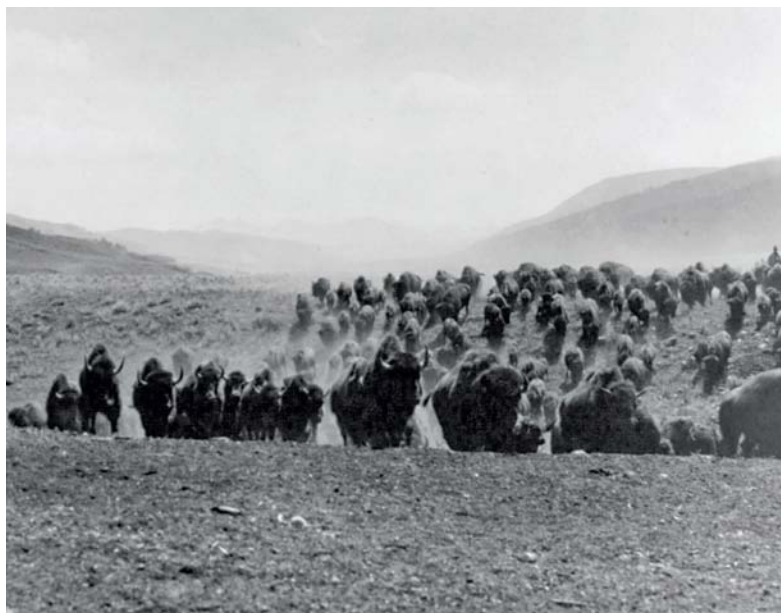
Pte-O-ya-te, the Buffalo People, or Buffalo Nation, 1917. The Lakota considered bison to be relatives, who provided humans with food, clothing, shelter, tools, medicine, and many other necessities.

Native communities have been able to survive and even thrive despite outside influences through traditional ceremonies and gatherings such as the Green Corn Ceremony. Communal