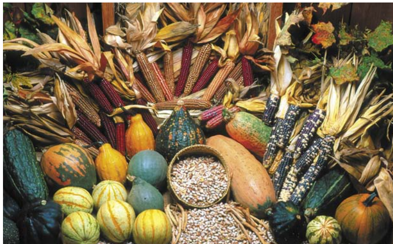
Some of the food plants that the Haudenosaunee give thanks for are corn, beans, and squash.